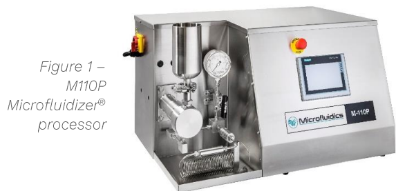
Figure 1 – M110P Microfluidizer® processor

In this study, all NLC formulations were manufactured by processing 5 passes at 30,000 psi through an M110P Microfluidizer® processor (figure 1).